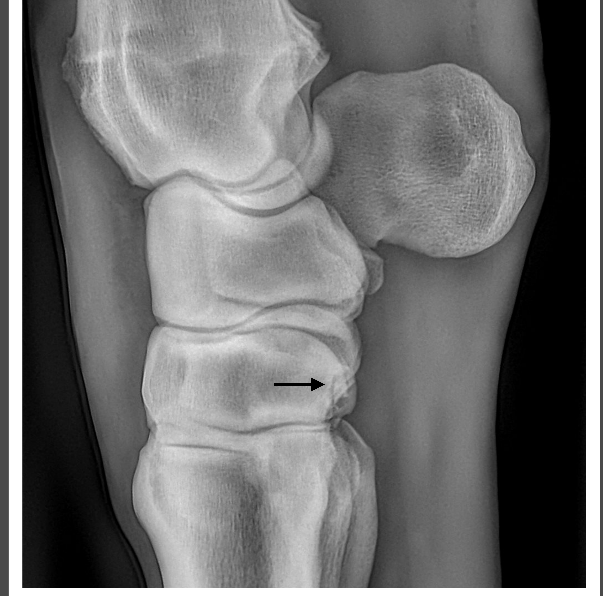
Fig. 2. Lateral to medial radiograph of the right carpus. Black arrow shows a fracture of the palmar distal aspect of the third carpal bone.

The unusual nature of this injury means the precise cause, application of efficacious therapy and long term prognosis is difficult to determine. Platelet-rich Plasma (PRP) is widely used in the treatment of soft tissue injuries in the equine patient. Although unproven in the horse, human and laboratory studies have shown PRP to accelerate the histological union of fractures and increase bone strength<sup>4</sup>. ESWT is another treatment modality that is used for a range of musculoskeletal injuries. Although the direct mechanisms are unclear, it is known to stimulate osteogenic cells and promote neovascularisation at bone-tendon junctions<sup>5</sup>. The collective use of these treatment therapies, in conjunction with the extended rest period, aim to return this horse to full athletic capabilities.