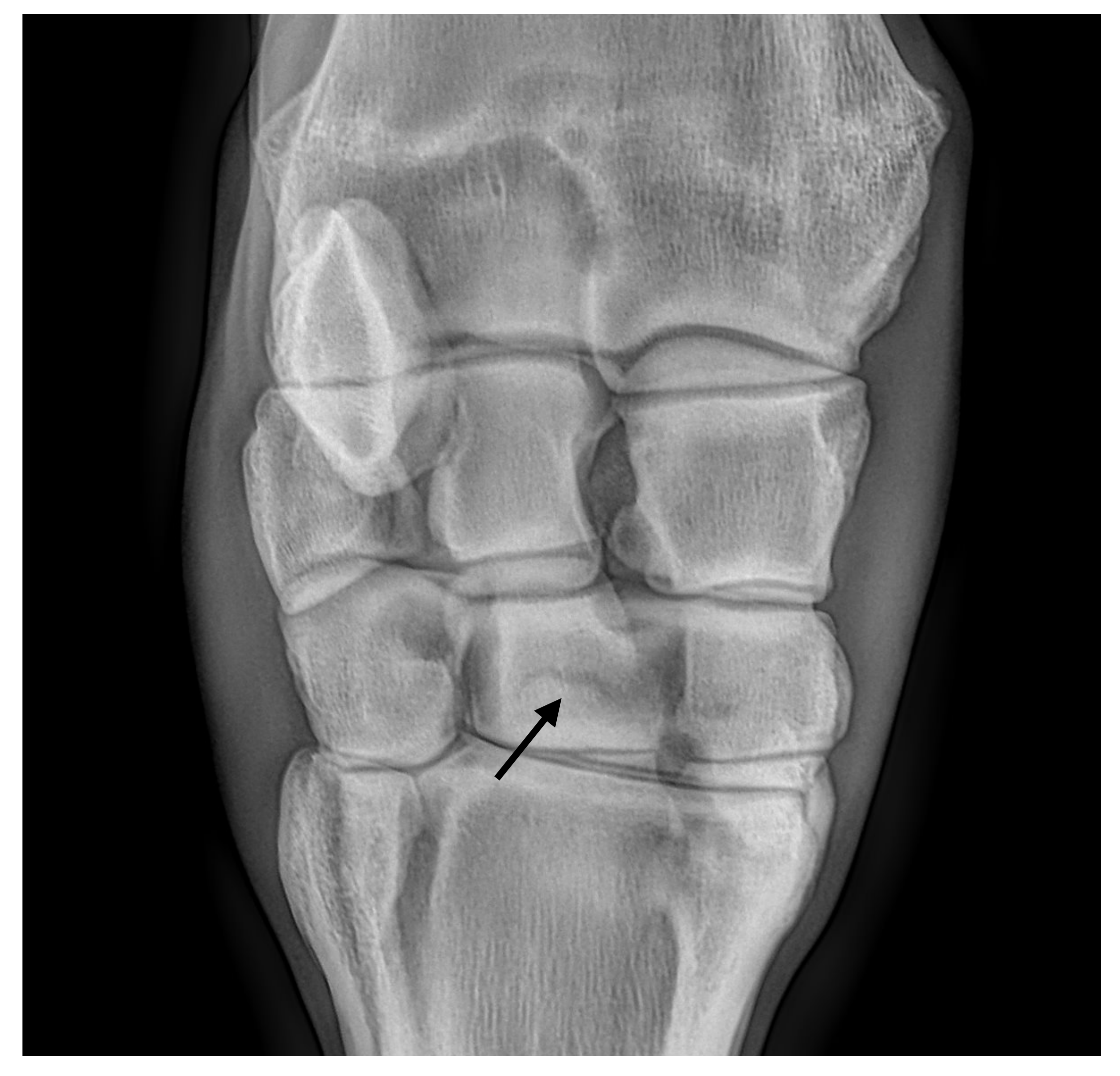
Fig. 1. Dorso-palmar radiograph of the right carpus. Black arrow highlights transverse radiolucent line in the third carpal bone.

Ultrasound examination of the palmar carpus was conducted but was inconclusive.